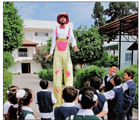
The joyful first day of the 2019 school year at the Gaza Lighthouse school.