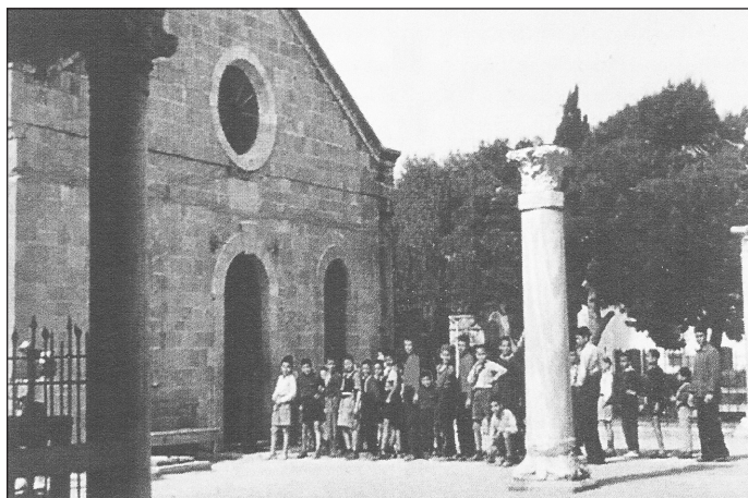
Forecourt of the Compound Church, 1958

A medical mission is a hospital facility, first and foremost, but underlying the diagnoses, the babies delivered and the dispensing of medicine lies its mission of proselytizing, “inducing someone to convert to one’s faith.” Members of the Mission Family were united and sincere in that goal, but the constant and pressing demands of their medical work came first. They also faced the unlikelihood of converting Muslims to Christianity. The Muslims already worshipped the same deity, respected the same commandments and enjoyed the same unquestioning adherence to their faith. (That’s not to say there aren’t monumental—sometimes ghastly—differences between the two religions.) Islam was the fabric of their society, and for one to become a Christian meant expulsion from family and from a way of life that was set in their bones. Everyone knew that conversion would be a giant leap with grievous consequences. But what Muslims would willingly, gratefully accept from the mission were medical treatment, secure jobs, training and education.