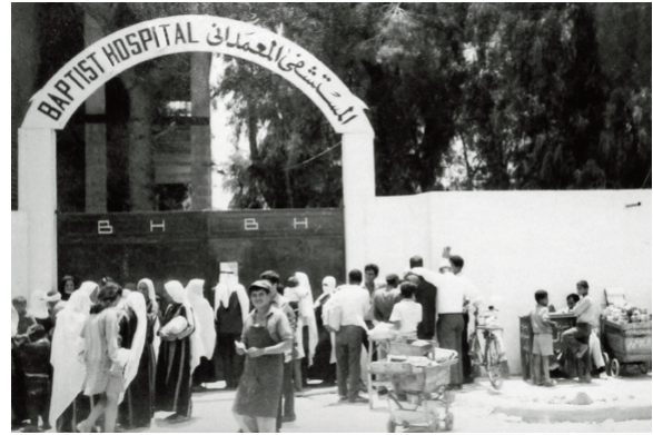
The Compound Entrance from Palestine Square

Compared to the hustle of dusty Palestine Square just outside its gate, the compound was a haven of calm and care. There was no place like it anywhere in the Gaza Strip. The grounds were green and beautiful, with well-tended lawns and gardens shaded by lofty trees and date palms. To my amazement, poinsettias grew ten feet high. A marble column, most likely from the sixth-century Byzantine era and easily 15-ft. tall, stood in the forecourt of the church just below my apartment. Other columns and Corinthian capitals lay scattered here and there on the compound grounds, and a couple of columns had even been reused in the construction of one of the old, nondescript hospital buildings. Each relic of antiquity was a silent reminder of an unimaginable Gaza lost over time, and there was no telling what lay buried below the compound.