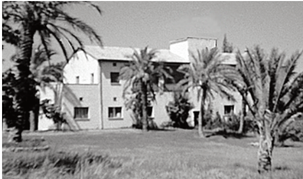
The Baptist Village, Petah Tiqva, Israel