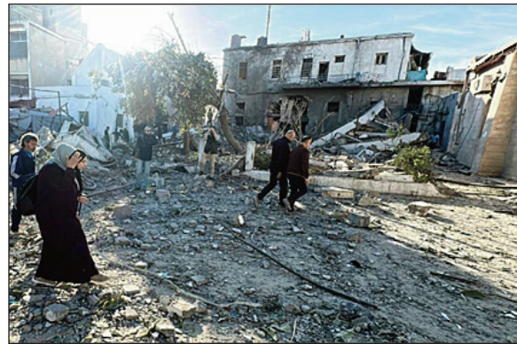
My apartment and rooftop terrace in the hospital compound in 1970 and following the April 2025 bombing.

Few among even my closest friends were aware of my long-ago adventure, much less its role in shaping my world view and sense of self. Until today, I was reluctant to share what I titled “Gaza” outside that trusted circle. But here you have it. (A gallery of related photos is posted separately as “Gaza Album.”)