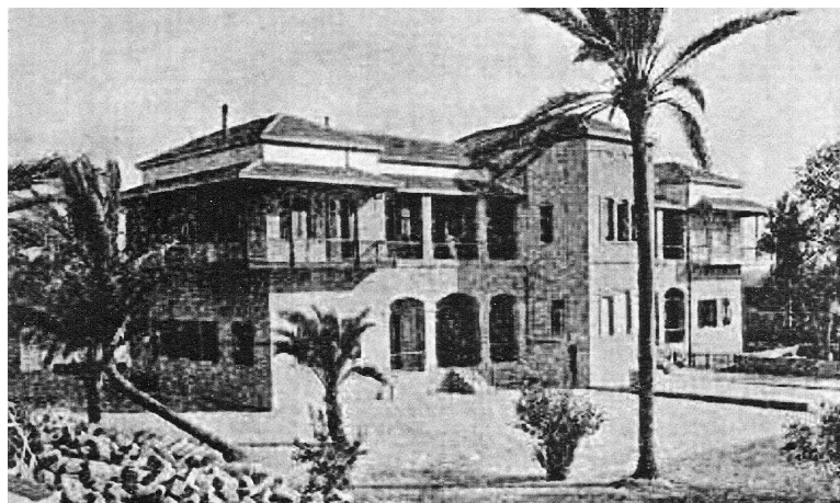
The Newly Constructed Hospital, 1907

I would later learn that the Anglicans' ownership of the compound land was in question when the Baptists purchased it. By agreement, no money was to be exchanged until title to the land was established once and for all. At the outbreak of the Six Day War, several old Gaza families were attempting to legally reclaim the compound, which the Baptists were yet to pay for. The ensuing military occupation halted judicial processes, and the mission was carrying on with that worry pushed aside.