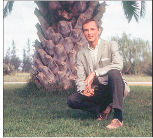
Me at Twenty-Four

off was forbidden. Except in our shared dorm rooms, we were either to be alone or in a group. The mantras were “Be flexible” and “No leaning,” that is, no reliance on another individual for emotional support. We were taught the basics of how to teach English as a second language and how to learn a foreign language, both in principle and in practice through lessons in the pidgin English of New Guinea. Using the very limited resources of the college library, we researched our destination and its culture. I had an advantage, having visited Gaza a year earlier. But there was an undercurrent to the training: We were living under the closest scrutiny, and before the summer ended, some of us would be deemed unsuitable and sent packing.